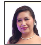
Soci Ame Patagani-Viking Community Service